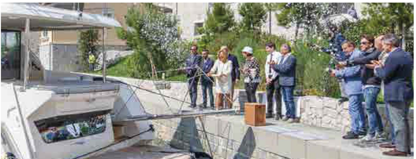
Absolute 58 Fly official presentation, that took place on Saturday, May 13th and Sunday, May 14th at Portopiccolo