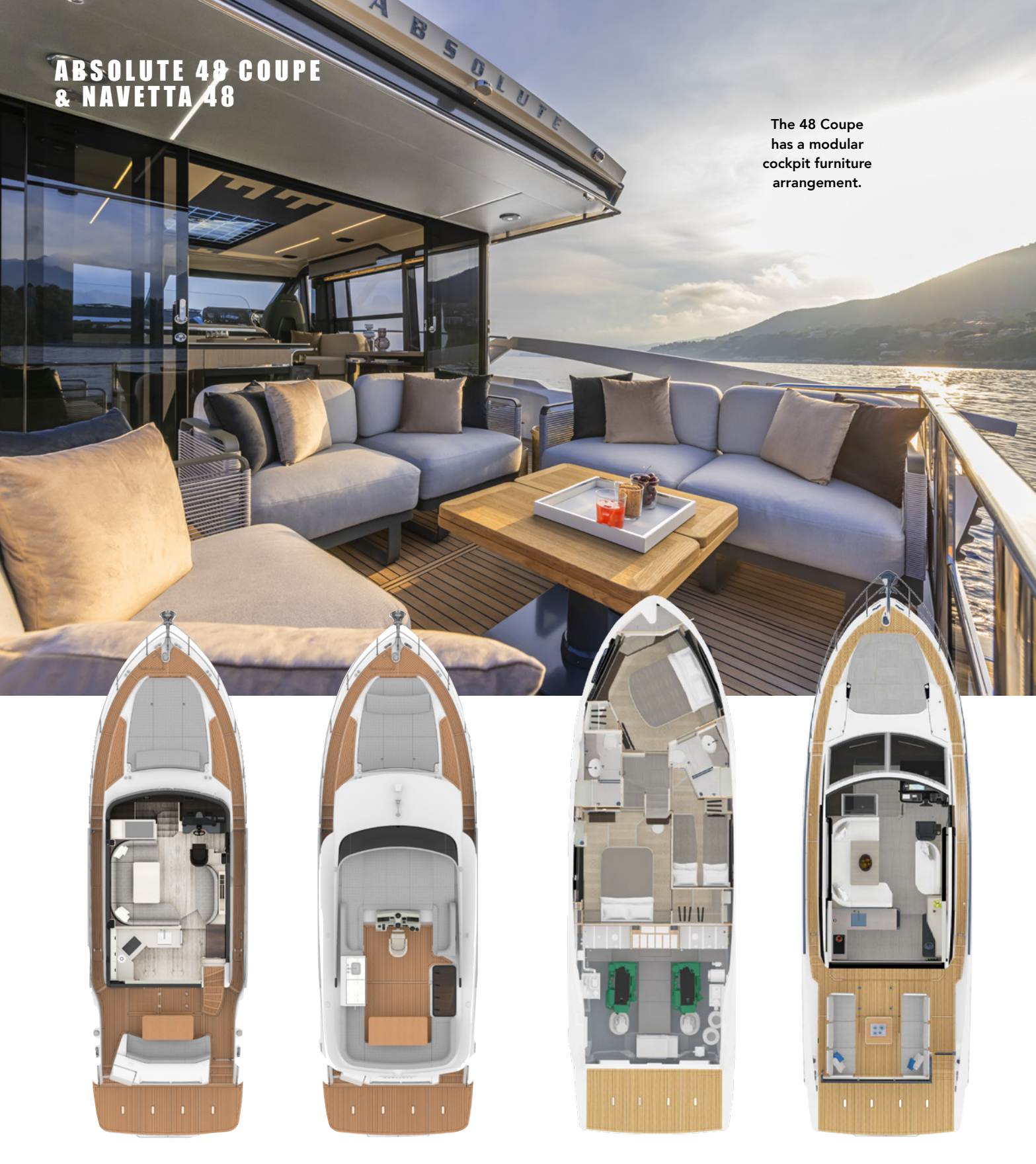
Absolute Navetta 48