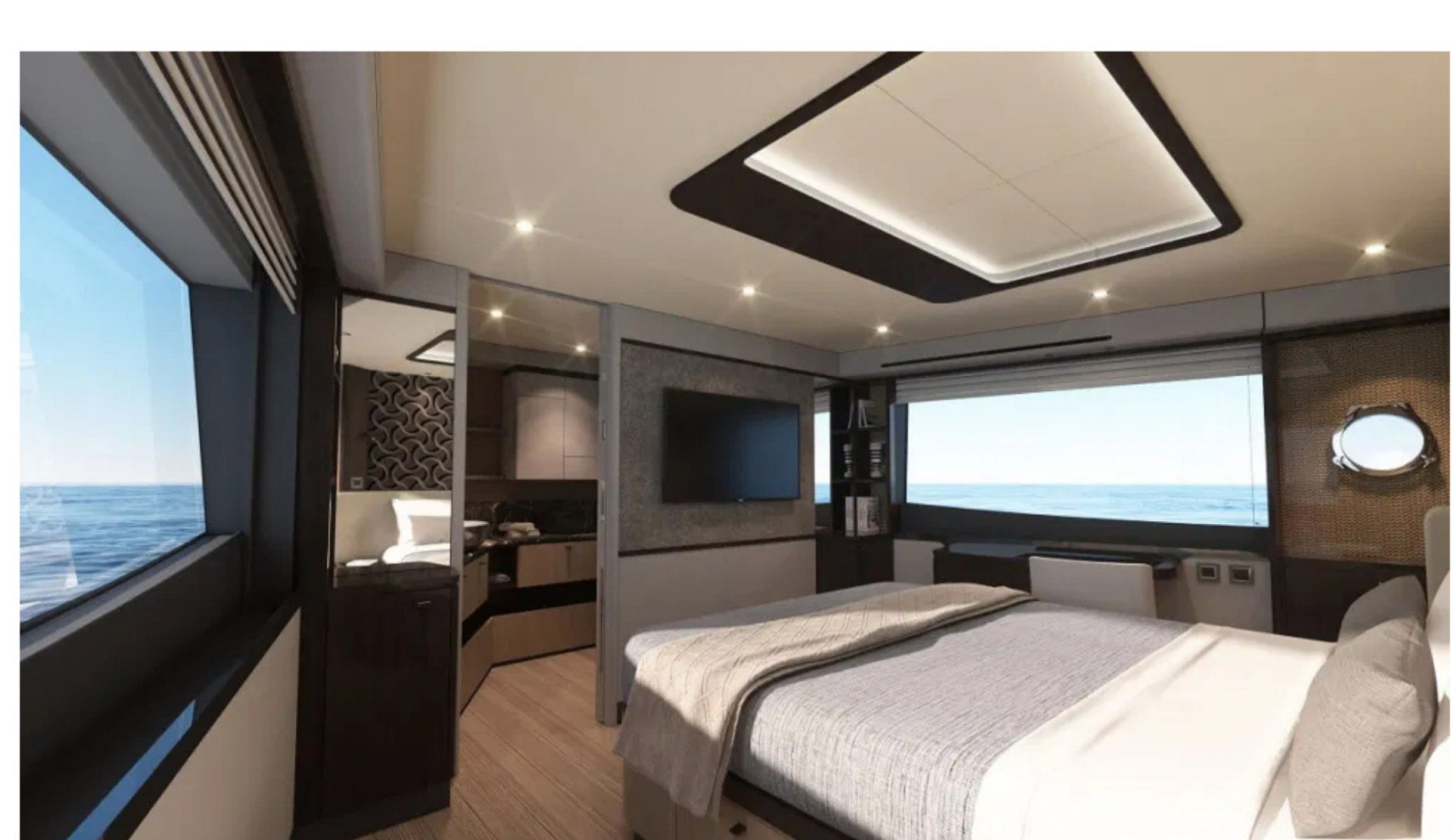
The master suite is forward, with the bathroom in the bow

The first 60 Fly is scheduled for a media preview in Savona in June before its official premiere at the Cannes Yachting Festival from September 7-12, along with the 48 Coupé, another of Absolute's 'Generation 2022' models.