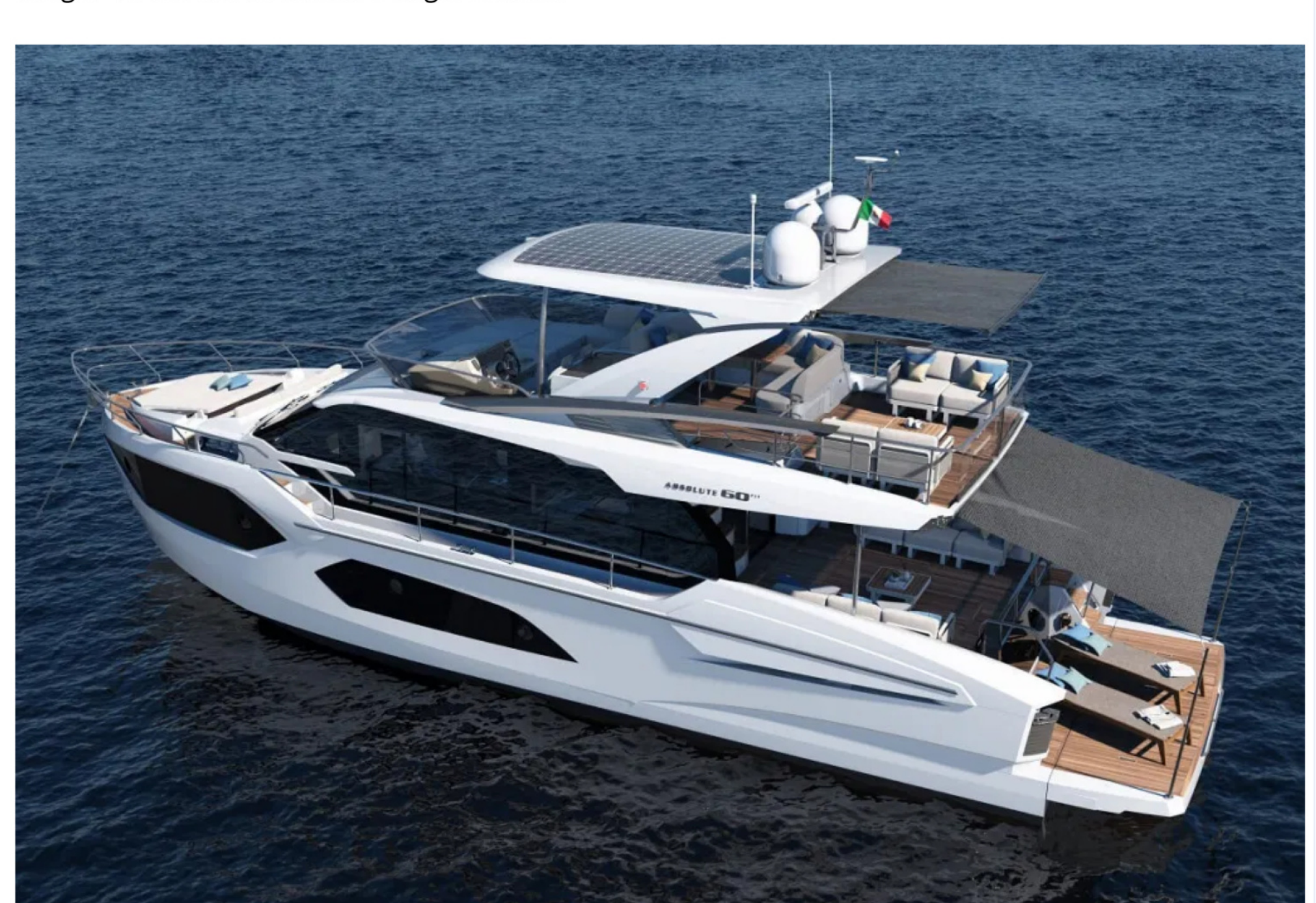
Solar panels can be fitted into the hardtop

The upcoming Absolute 60 Fly features a full-beam master cabin forward on the lower deck, following the designs on the Italian builder's larger models.