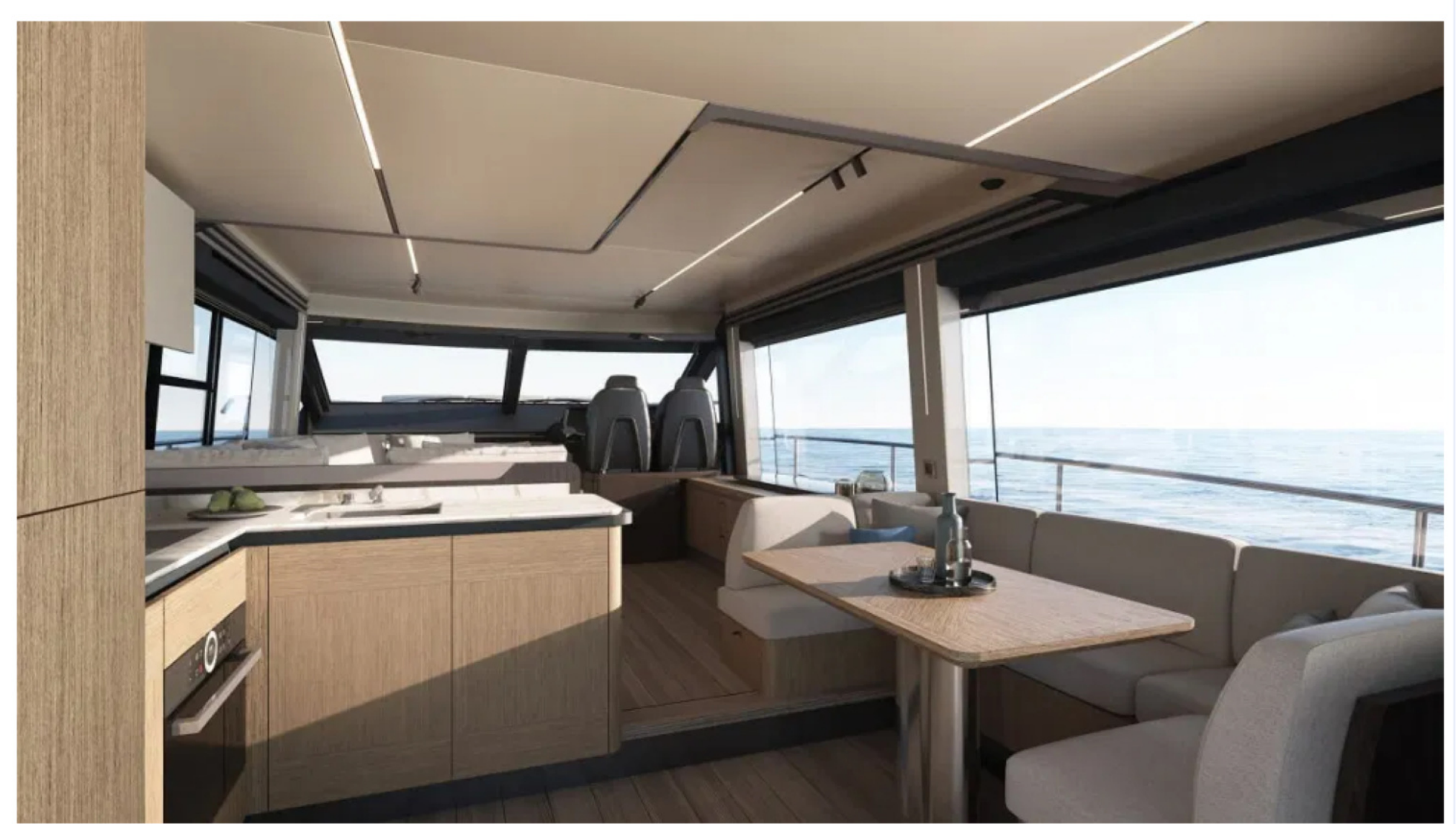
The galley and dining table are aft

The main-deck interior features an aft galley and a dining table to starboard, while up a step is the saloon with a C-shaped sofa to port and a cabinet with TV to starboard.