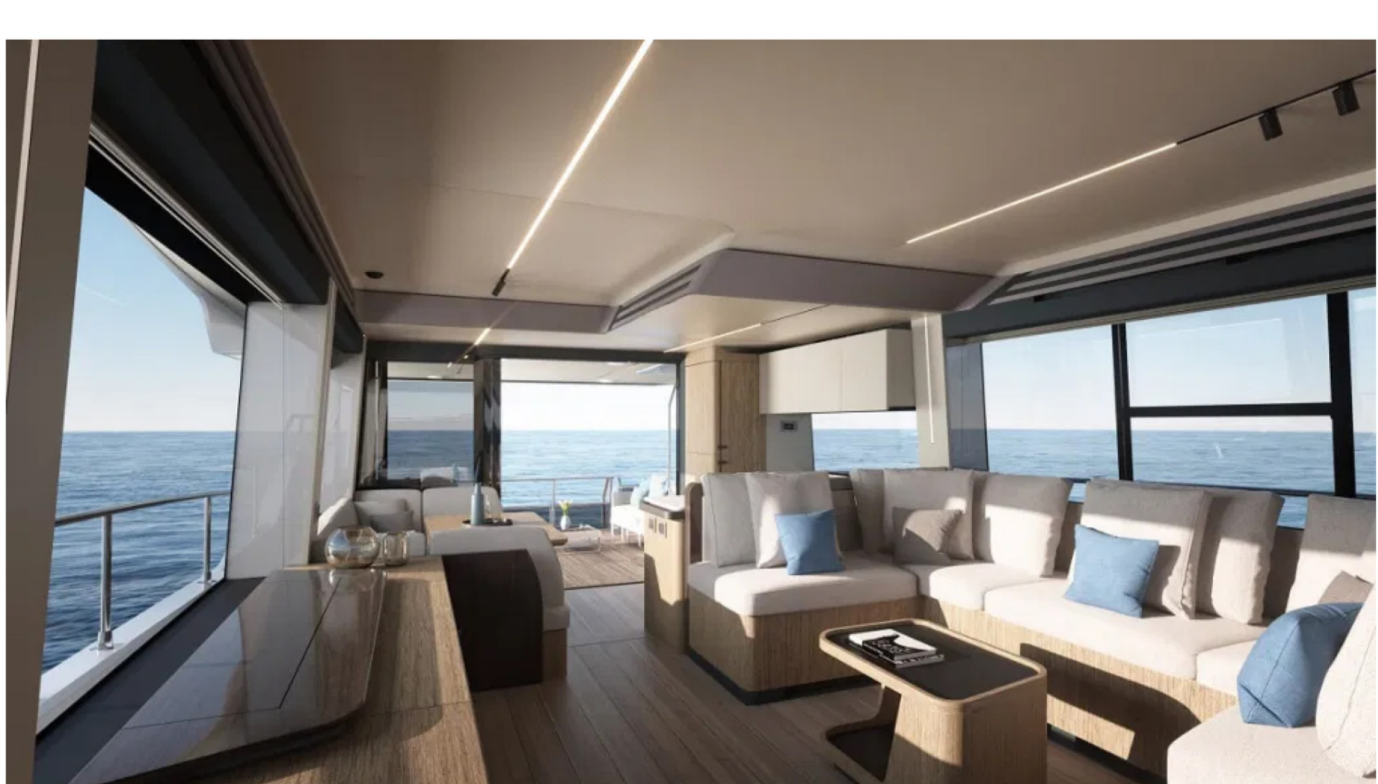
The saloon has a C-shaped sofa to port

On the main deck, the aft cockpit's standard configuration is as an 'aft deck terrace', with a clear deck to be dressed with free-standing furniture at the owner's choice. The deck sits above the crew cabin, accessed through the pantograph door in the transom.