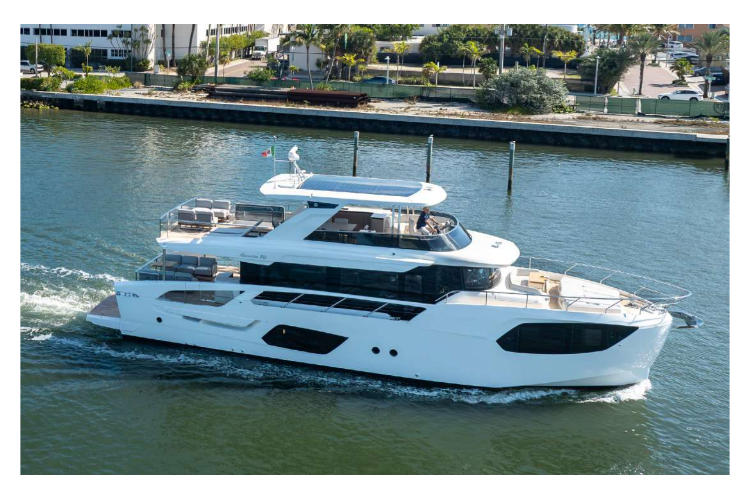
YACHT DIGEST 8 SEA TRIAL SPECIAL

But let's take things step by step and see how this beauty performed at sea.